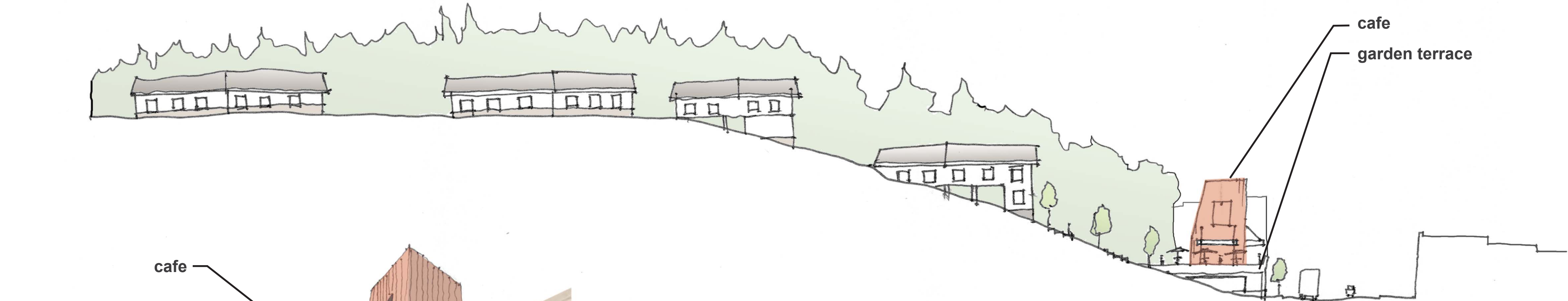
site section aa 1"=40'