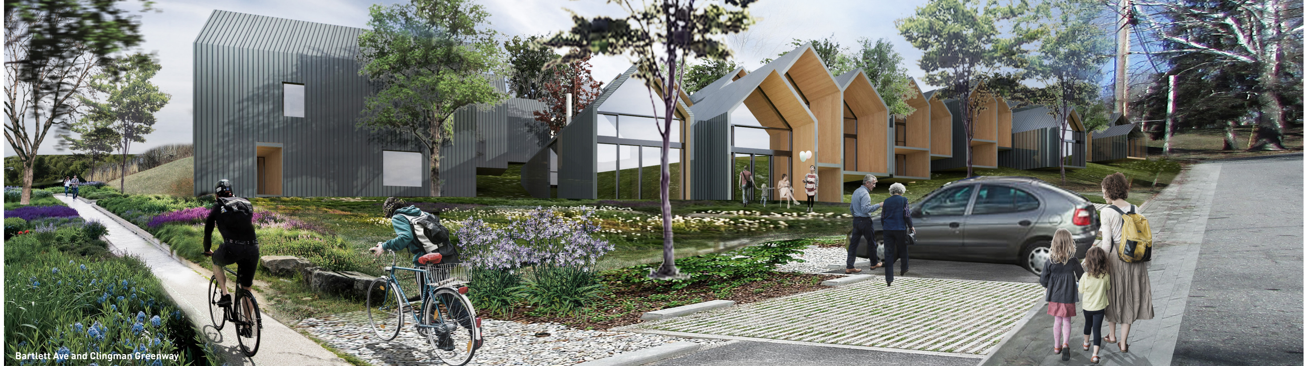
Bartlett Ave and Clingman Greenway